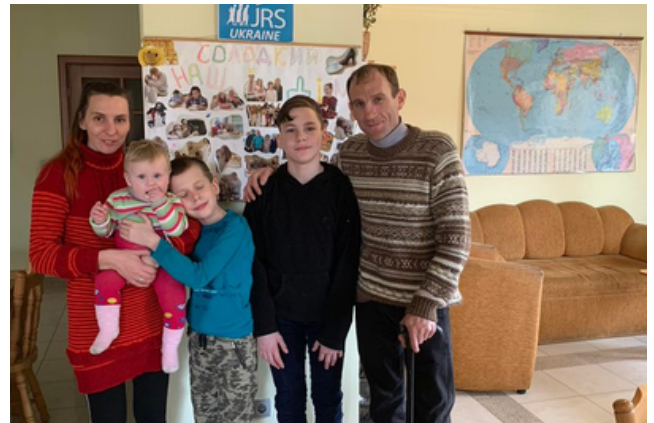
Family in the Jesuit community in Lviv

Your support and investment is needed for these programs. Thank you. www.jrsusa.org/Ukraine