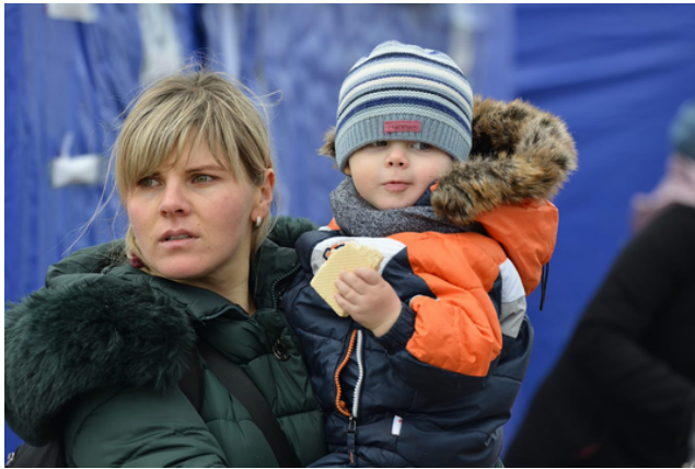
Woman and child at JRS location in Romania