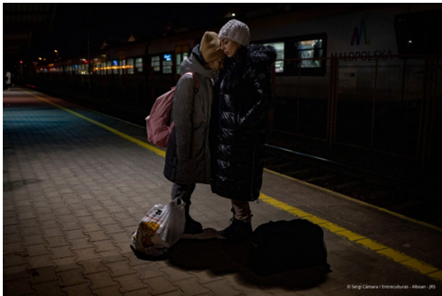
Awaiting the train in Poland