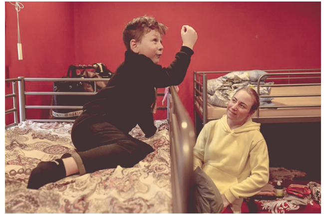
Siblings in JRS facility in Romania