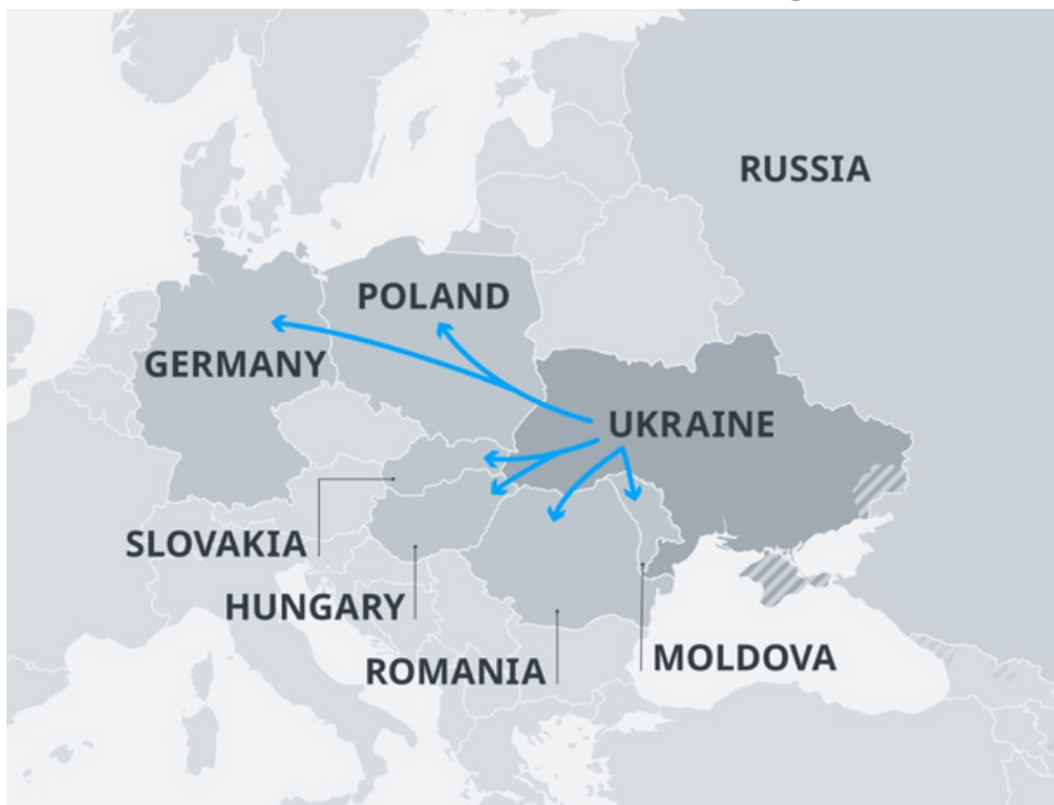
Map of Ukrainian refugee migration from (UNHCR)

JRS is on the front lines of the response to families fleeing their homes in Ukraine. We have been following with concern the developments there even before the start of the Russian military offensive. We join with Pope Francis in grieving the “diabolical senselessness of violence” and is asking all parties to “refrain from any action that would cause more suffering.”